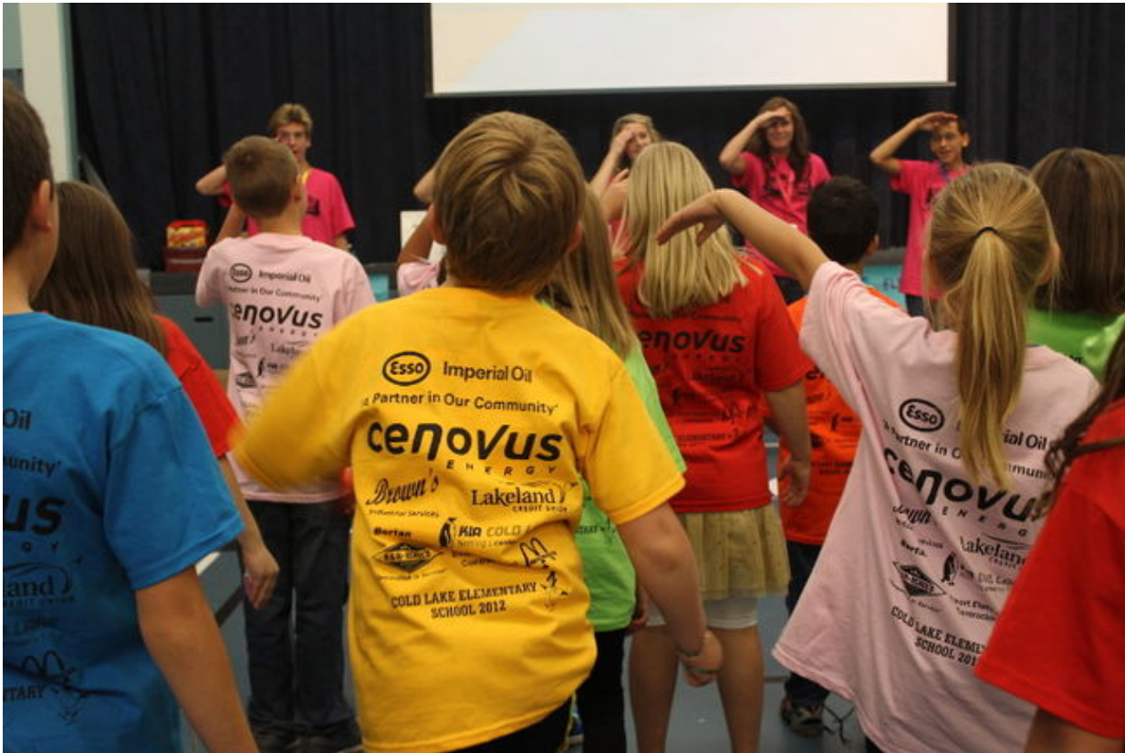
Cold Lake Elementary School students get involved in a Building Bridges activity led by Cold Lake High School students on Oct. 4, 2013.

McKale said a significant part of the day occurred at the end, when the school's other students joined the Grade 3's. She said the information and enthusiasm had been transferred from the high schoolers to the workshop participants, and "the Grade 3's (transferred) it to the whole school."